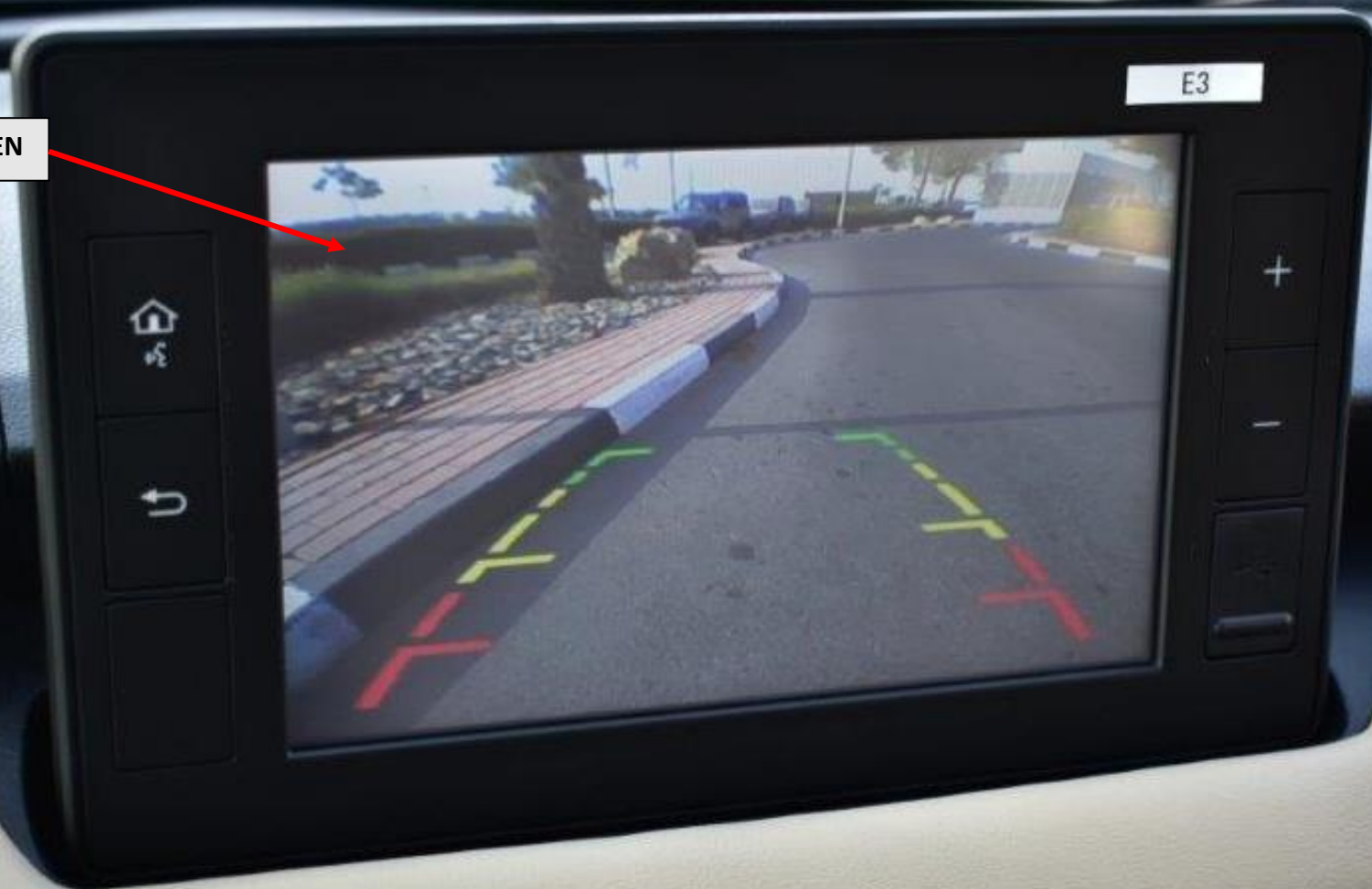
8" TOUCH DISPLAY SCREEN