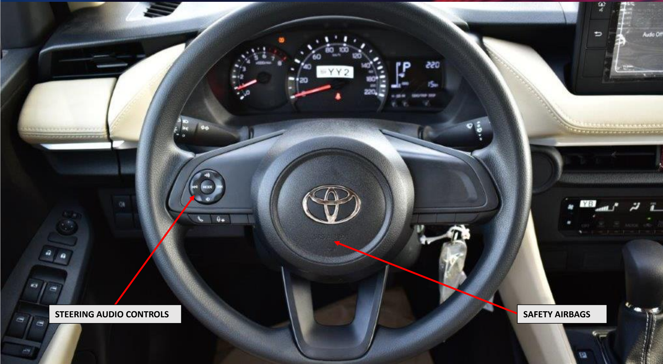
STEERING AUDIO CONTROLS